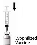
Figure 2. Transfer saline diluent into the lyophilized vaccine vial.