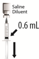
Figure 1. Cleanse both vial stoppers. Withdraw 0.6 mL of saline from diluent vial.

MENHIBRIX is to be reconstituted only with the accompanying saline diluent. The reconstituted vaccine should be a clear and colorless solution. Parenteral drug products should be inspected visually for particulate matter and discoloration prior to administration, whenever solution and container permit. If either of these conditions exists, the vaccine should not be administered.